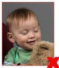
Eyes not open/toy visible