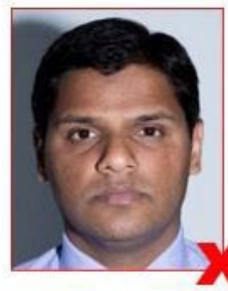
Shadows on image and background