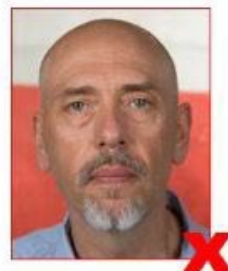
Background not plain