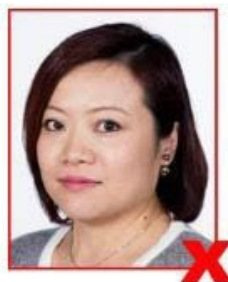
Side on to camera