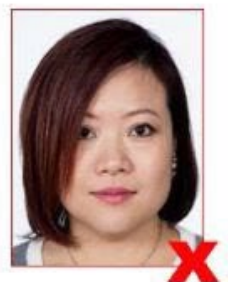
Hair obscuring face