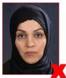
Background too dark