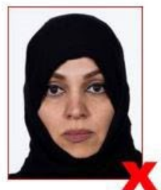
Eyes/edges of face obscured