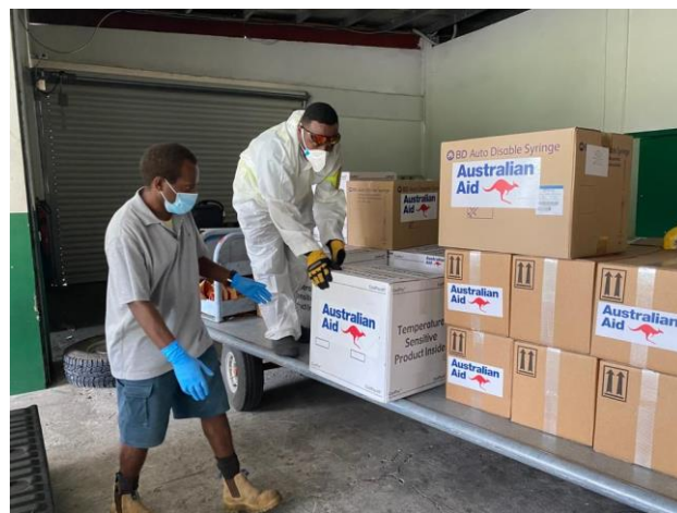
Australian High Commission and Government of Vanuatu staff unload the COVID-19 supplies and vaccines